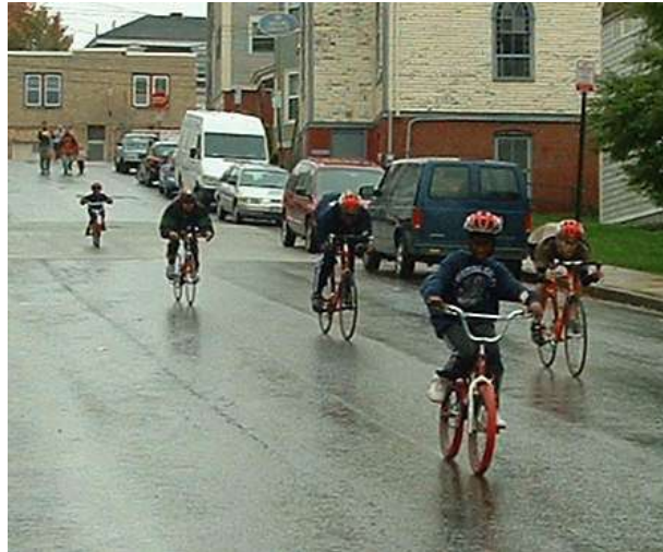
Queuing up wet and descending wetter: Saturday Oct. 27.