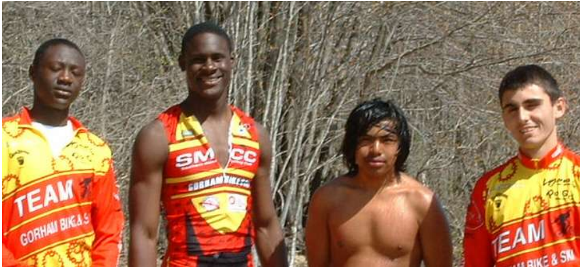
Older Riders react to the season's first ride to (and dip in?) Sebago.