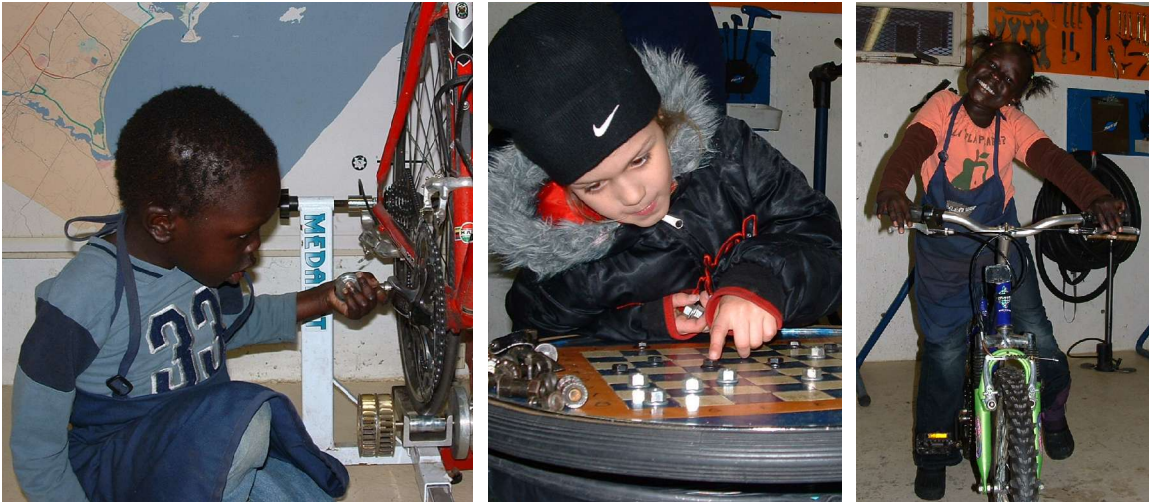
Understanding gears, learning strategy, and showing the joy of a new bike!