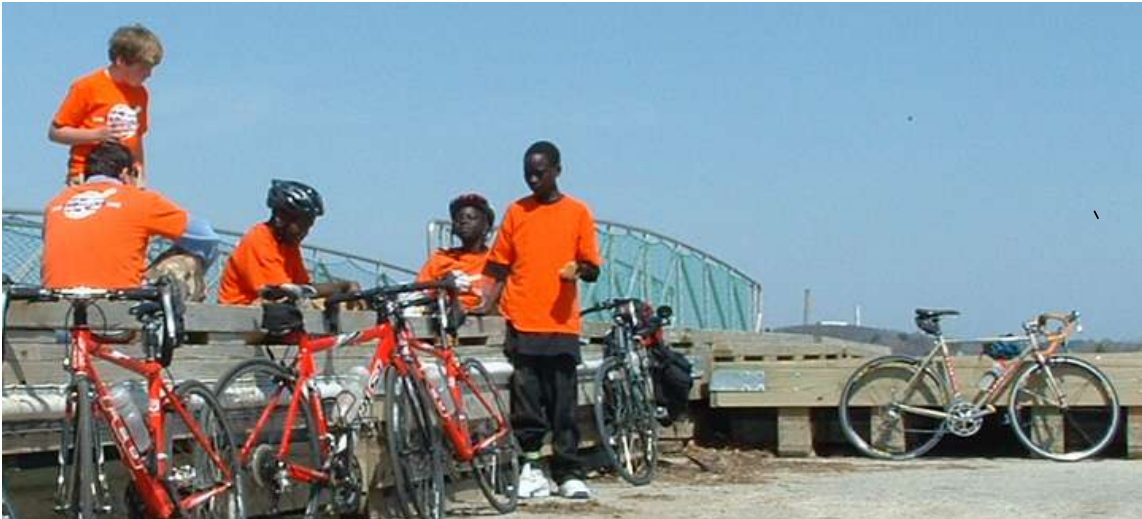
Intermediate riders picnic at the Falmouth Town Landing